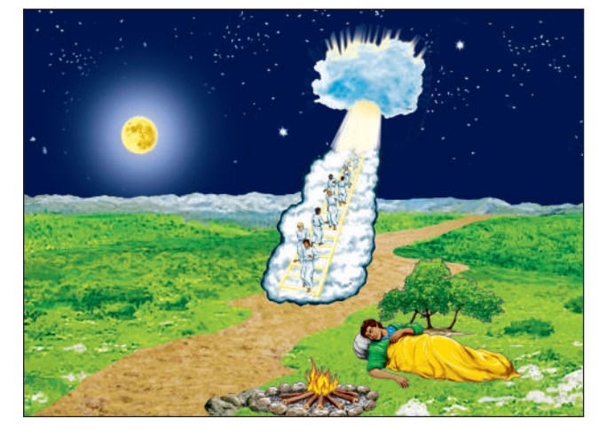
Backgrounds/Overlays (For scene one/in order used)