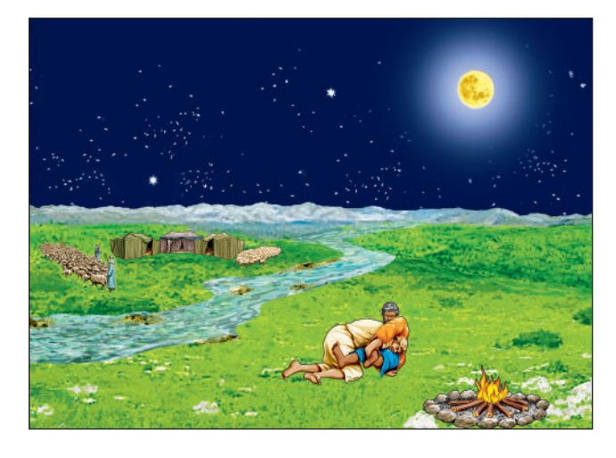
Backgrounds/Overlays (For scene one/in order used)